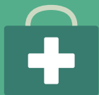
Medical Forensic Examination

We are staffed 24 hours a day, 7 days a week. Our services are free of charge. Services are available to ALL ages - men, women, and children. Counseling and advocacy services are available to anyone who identifies as a survivor of sexual assault, sexual abuse, incest or human trafficking, no matter when it occurred. Our services are available to anyone, despite where they live or where they were assaulted.