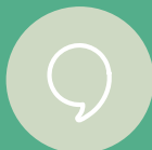
Expert Witness Testimony